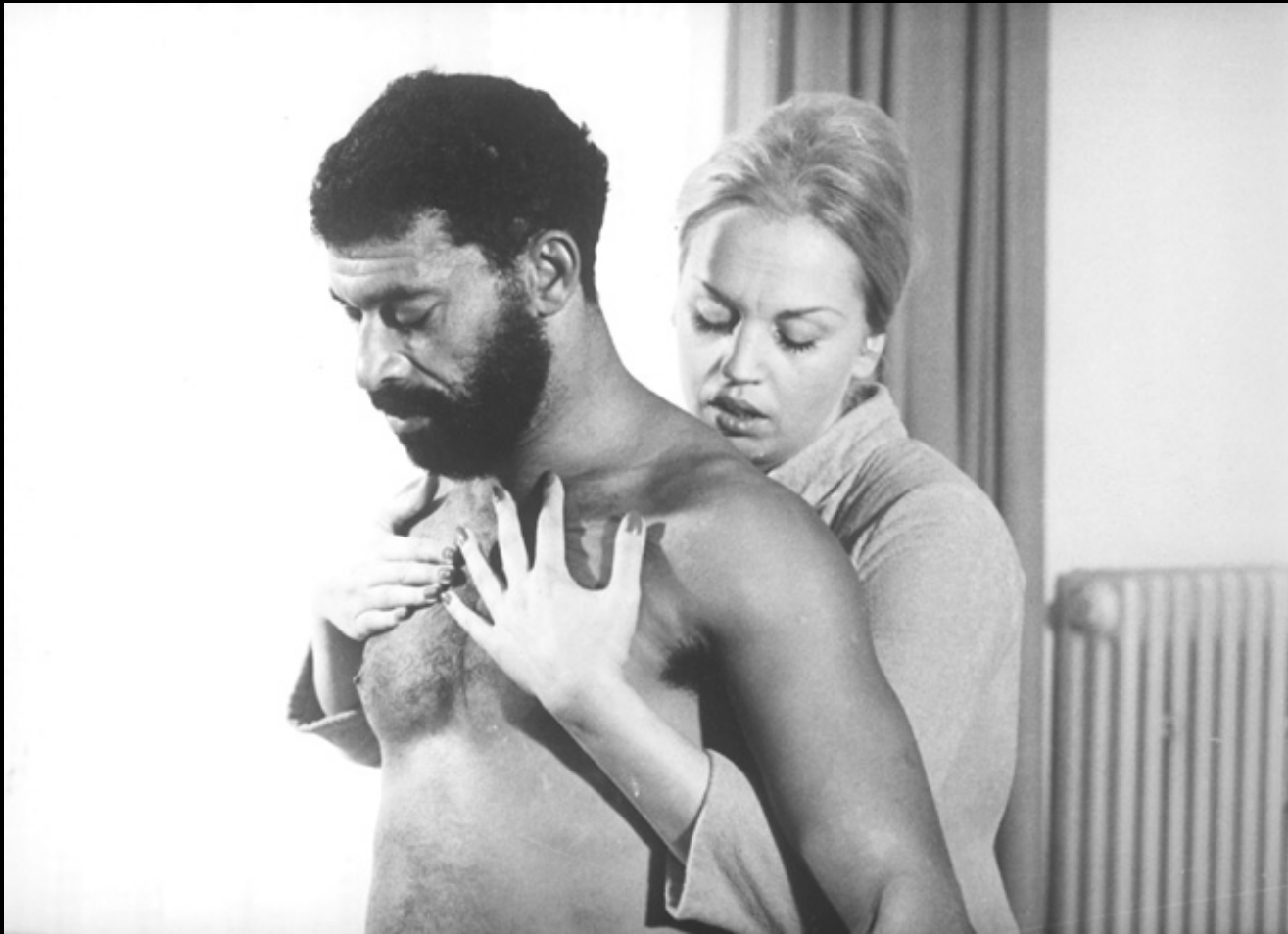
Fear Eats the Soul