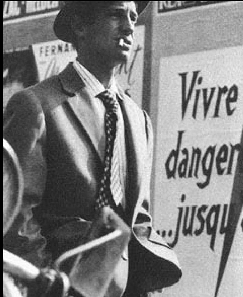
Jean-Paul Belmondo in A bout de souffle (1959)