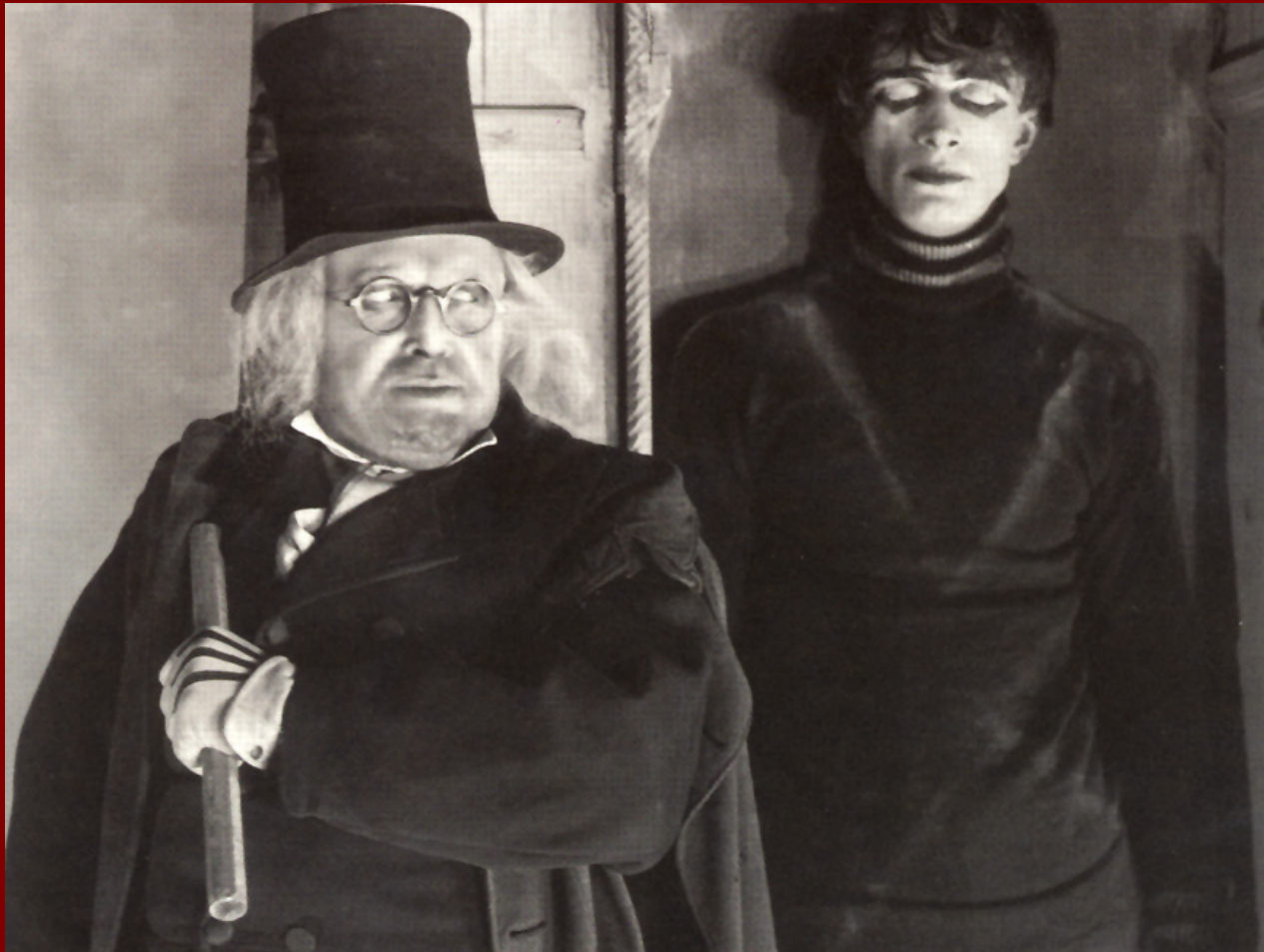
Cabinet of Dr. Caligari