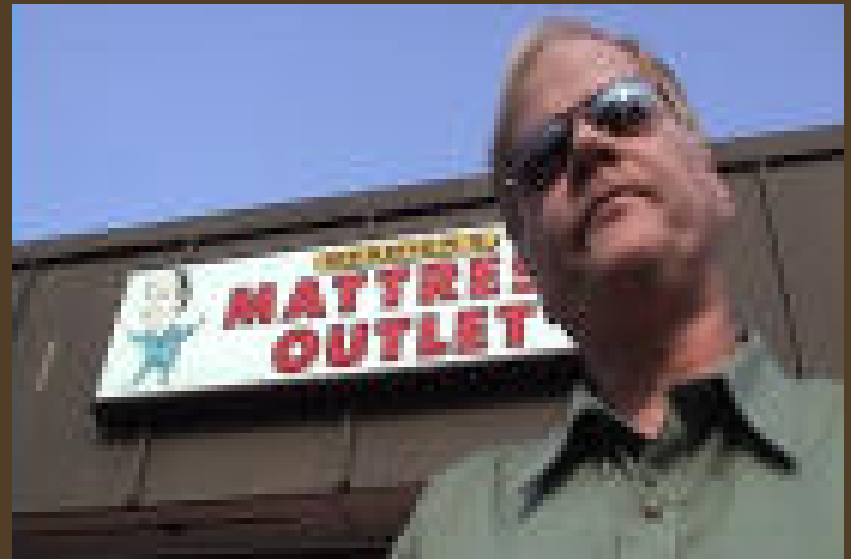
Low angle shot